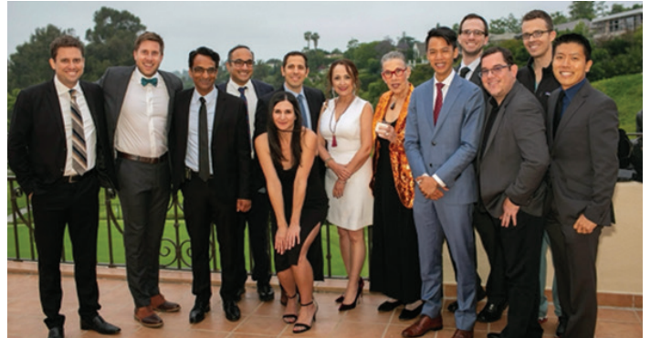
Faculty, fellows and staff taking a photo opportunity overlooking the country club golf course.