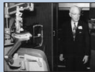
Creation of the idea by an anonymous donor

Donated by Uncle Claude, Inc. and supported as a philanthropic activity of the Karl Kirchgessner Foundation, the Mobile Eye Clinic has been funded entirely by private donations since its inception in 1975. Operating from a specially equipped 40-foot bus with a staff of ophthalmologists, technicians and volunteers, the Mobile Eye Clinic makes four weekly visits to community locations including public and private schools, social services agencies working with abused and foster children, free clinics, and organizations serving low-income families and the homeless.