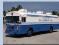
Second bus purchased