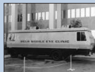
First bus burns to the ground on the way to an Indian Reservation