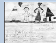
The Karl Kirchgessner Foundation begins yearly grants to MEC