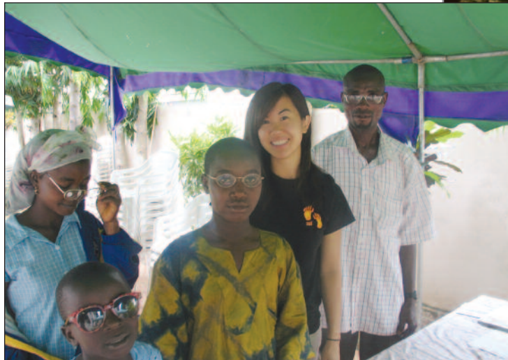
Eyeglasses donated through the Affiliates Shared Vision program are happily received by patients at a recent clinic mission in Ghana, Africa

On Friday, May 19th, in conjunction with the 2006 JSEI Clinical and Research Seminar, the Affiliates treated JSEI alumni, faculty, and staff to birthday cake in celebration of the Institute's 40th Anniversary. Surrounded by balloons and celebratory banners on the JSEI terrace, Affiliates board members and volunteers distributed over 400 individual cakes to everyone that joined the festivity. Later that evening, the anniversary celebration continued with a reception and dinner for faculty, alumni and invited guests.