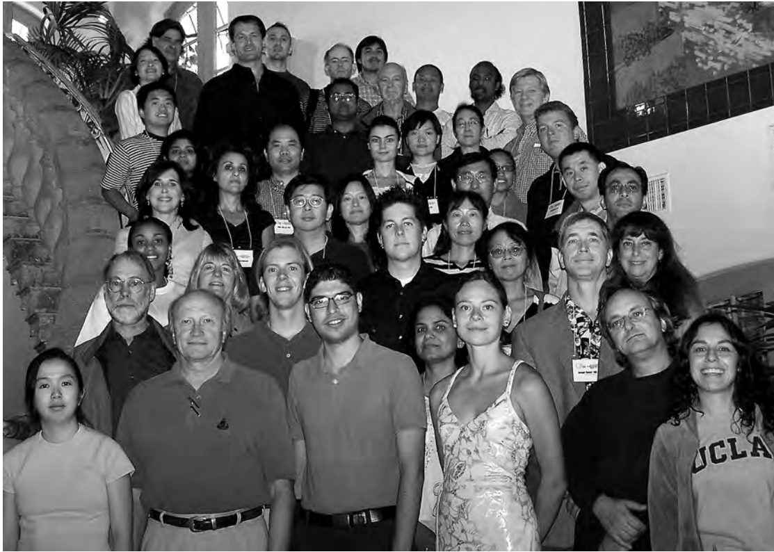
Over 45 basic scientists and clinical researchers attended the Eleventh Annual Vision Science Conference in Oxnard, California.

On September 23-25, 2005, over 45 basic scientists and clinical researchers gathered for the Eleventh Annual Vision Science Conference at the Embassy Suites, Mandalay Beach Resort in Oxnard, California. The event was sponsored by the National Eye Institute Vision Science Training Grant and the Jules Stein Eye Institute.