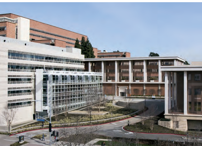
Stein Eye Institute

Stein Eye's alliance with Doheny may make us the nation's, if not the world's, largest academic affiliation.