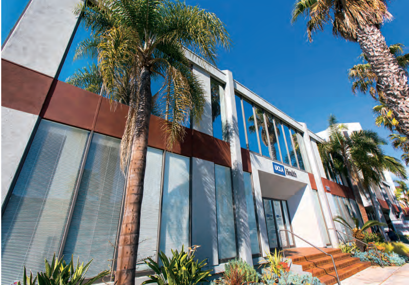
The Stein Eye Center-Santa Monica is conveniently located on Wilshire Boulevard, between 18th Street and 19th Street.