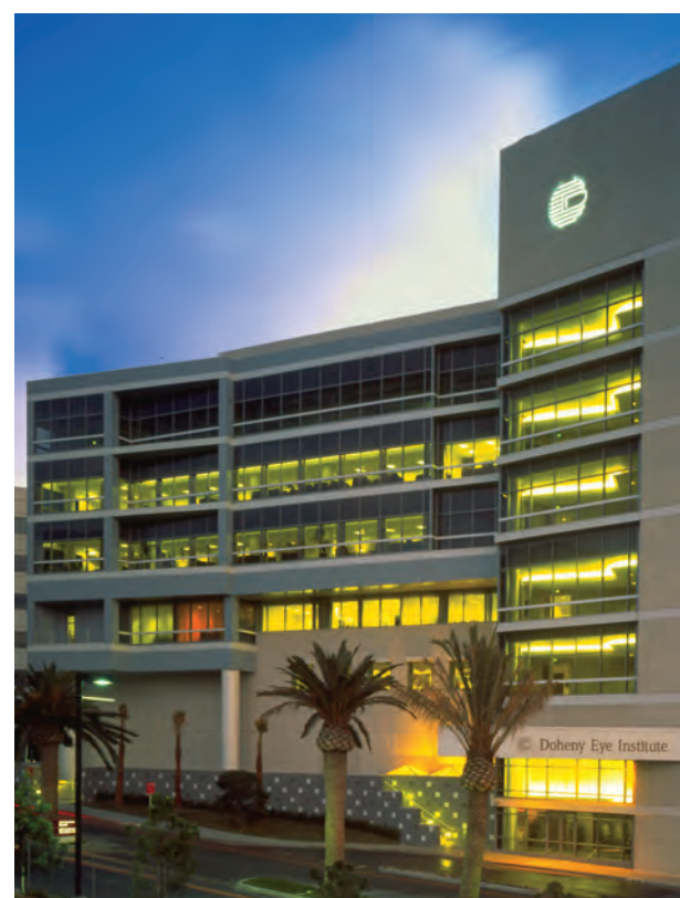
Doheny Eye Institute

Through this partnership, we can have a tremendous and positive impact on our community, nation, and beyond, extending our efforts in vision science and technology, nationally and internationally.