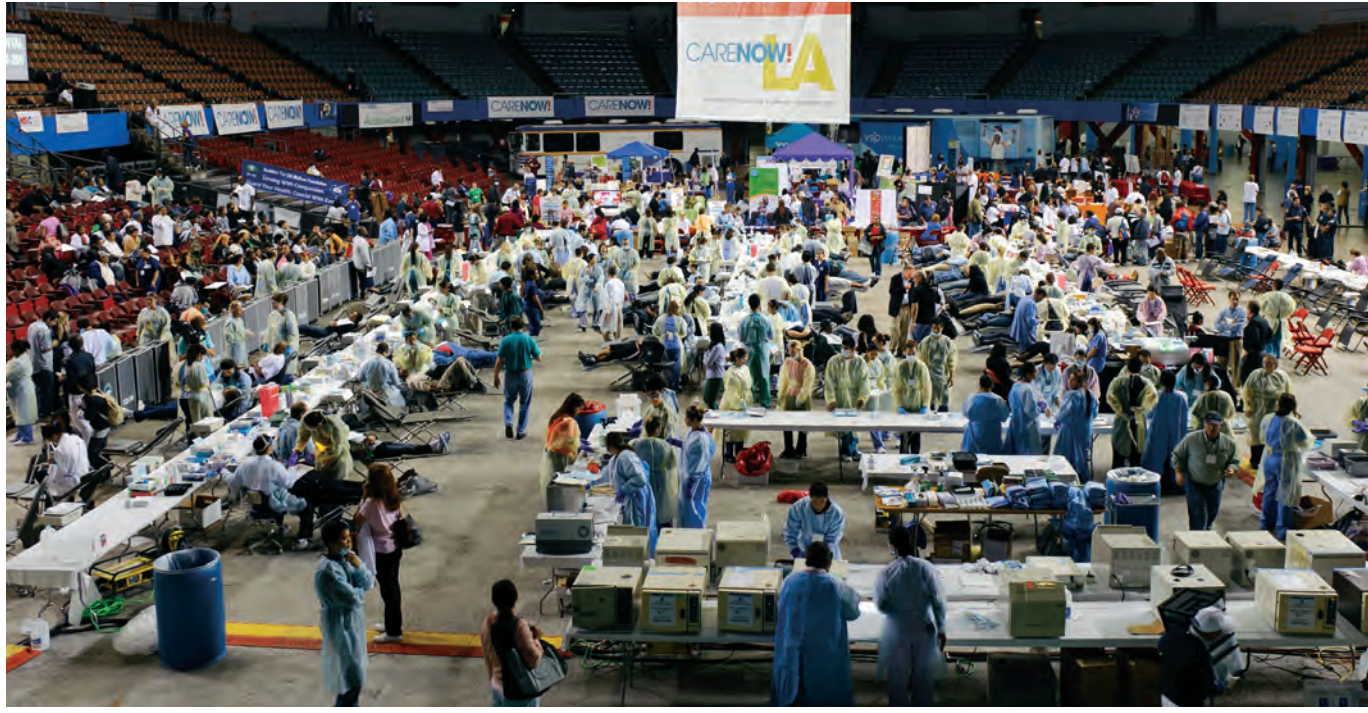
Some of the approximately 2,000 attendees who sought eye services during the four-day long CareNow/LA Free Clinic.

More than a dozen JSEI ophthalmologists, working alongside ophthalmic residents, volunteered for shifts. Out of the approximately 2,000 attendees who sought eye services, the Mobile Eye Clinic staff provided ophthalmic screening to roughly 500 patients at risk for diseases such as cataracts, diabetic retinopathy, macular degeneration, and glaucoma. Also on hand was an optometrist to assist those who needed only eyeglass-related services. Approximately 150 of those patients were referred for further evaluation and/or treatment.