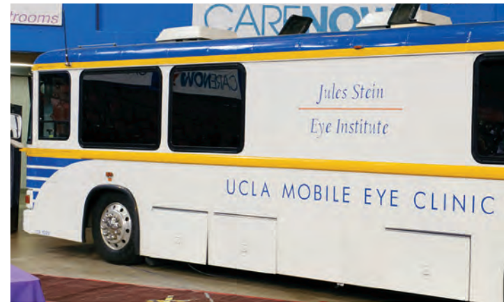
Staffed by JSEI ophthalmologists, technicians, and volunteers, the UCLA Mobile Eye Clinic brings ophthalmic care to underserved areas of Los Angeles.