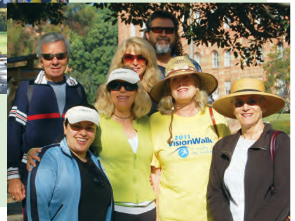
A few of the “Team JSEI” members who walked to raise money for vision research.