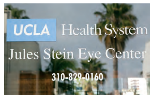
The Jules Stein Eye Center offers a convenient alternative to patients.

The Center provides nearly all the evaluation, diagnosis, testing, and treatment services available at the Jules Stein Eye Institute in Westwood while providing greater convenience to patients.