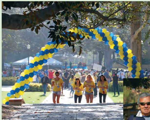
The 2011 FFB VisionWalk, held on campus at UCLA’s Dickson Court, raised over $110,000 for retinal eye disease research.

The FFB is a nonprofit organization committed to funding research to prevent, treat, and cure retinal degenerative eye diseases. As a lead sponsor of VisionWalk, JSEI has participated in research on a number of inherited retinal diseases and received grants for the continued study of vision-loss treatment and prevention.