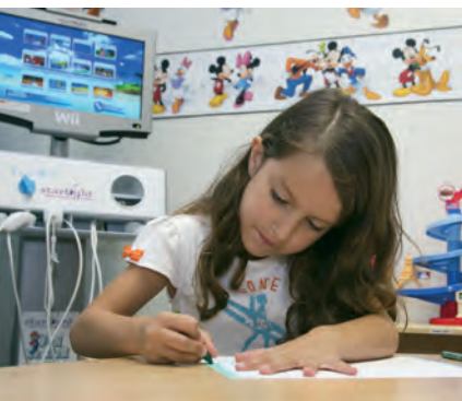
A young visitor enjoys the new Jules Stein Play Room located on the surgical floor of the Institute.