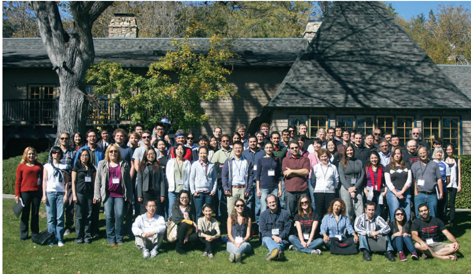
Faculty, fellows, and graduate students at the 17th Annual Vision Science Conference at UCLA's Lake Arrowhead Conference Center

The guest and JSEI speakers, as well as approximately 22 oral and poster presentations, sparked an animated discussion and generated the opportunity for potential research collaborations.