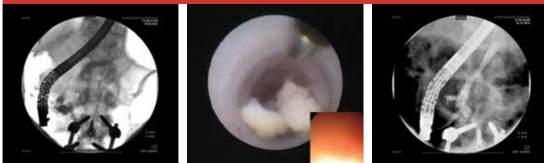
Sequential images of endoscopic treatment of chronic pancreatitis. Left: Fluoroscopic view showing severe changes with stricture and stones. Middle: Pancreatotomy with EHL probe in view after stone fragmentation. Right: After therapy with clearance of stones and dilation of stricture.

tortuosity of the duct and with the disease process there are often strictures that get in the way.” One alternative, extracorporeal shockwave lithotripsy followed by repeat ERCP to clear the fragmented stones, appears to be effective but is not commonly available in U.S. hospitals.